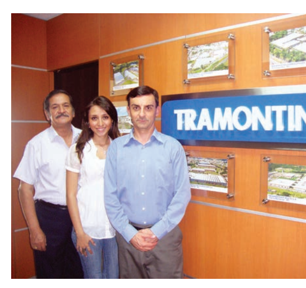
The new Tramontina sales office in Ecuador

The news doesn't end there. In August, Tramontina Colombia also acquired a new sales office. With more than 3,200 m<sup>2</sup>, the unit has rooms, showroom and stores – all made to measure for Colombian, Panamanian and Venezuelan clients.