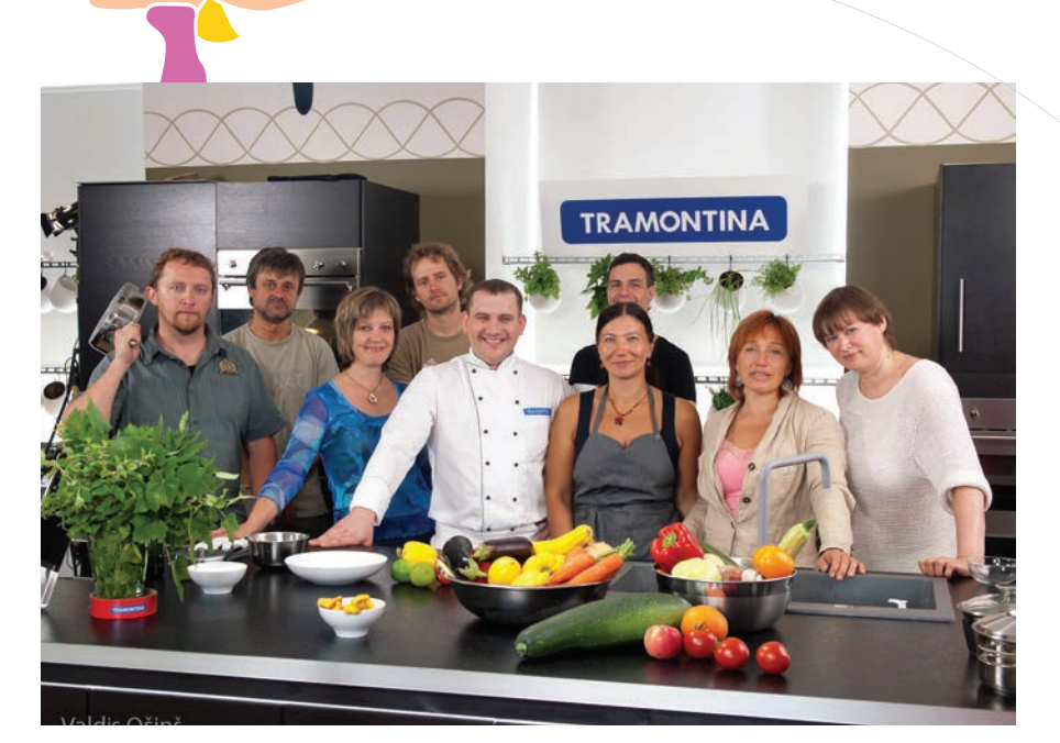
Production of Internet cookery programme